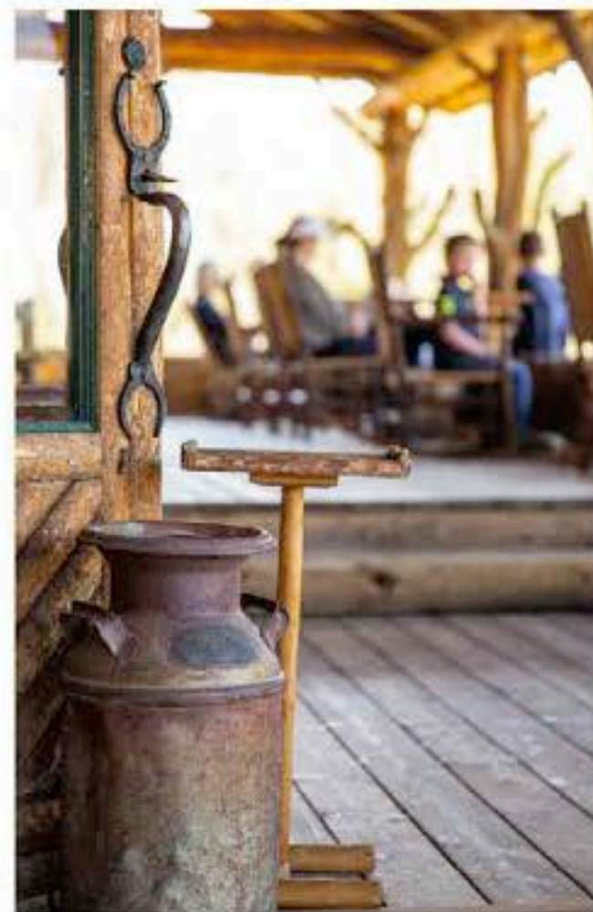
Top: Guest cabins promise the most comfortable sleep imaginable. Right: Original touches abound. Sandra found this milk jug in an antique shop. The label reads: "Idaho Rocky Mountain Club."

"The new laundry and staff buildings are tucked away on a hill, well out of view of the guests. They are purely functional in nature, and their utility exceeds their beauty, to be sure, but they